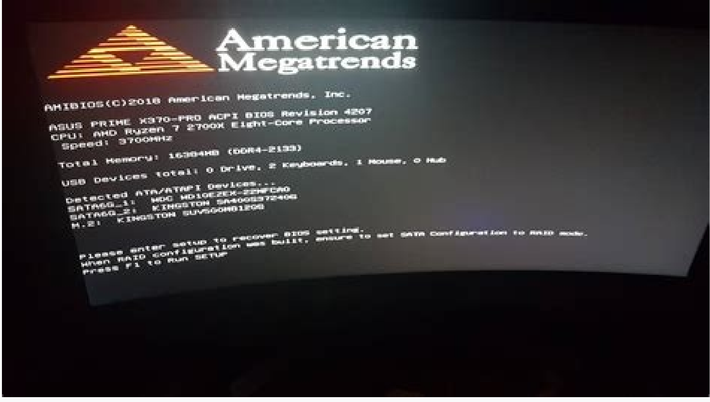
Ami 7.07 bios update. Ami f.23 bios update. Ami uefi bios update. Ami 7.14 bios update. Ami aptio dt 2006 bios update. Ami 7.16 bios update. Ami aptio bios update. Ami 4.6.5 bios update.